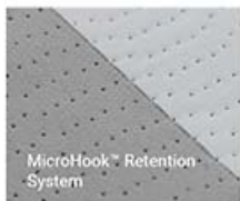
MicroHook™ Retention System