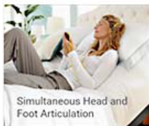
Simultaneous Head and Foot Articulation

Available in the following sizes: Twin, Twin XL, Full, Full XL, Queen, Split Queen, and Split California King.