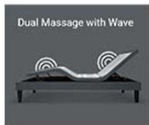
Dual Massage with Wave